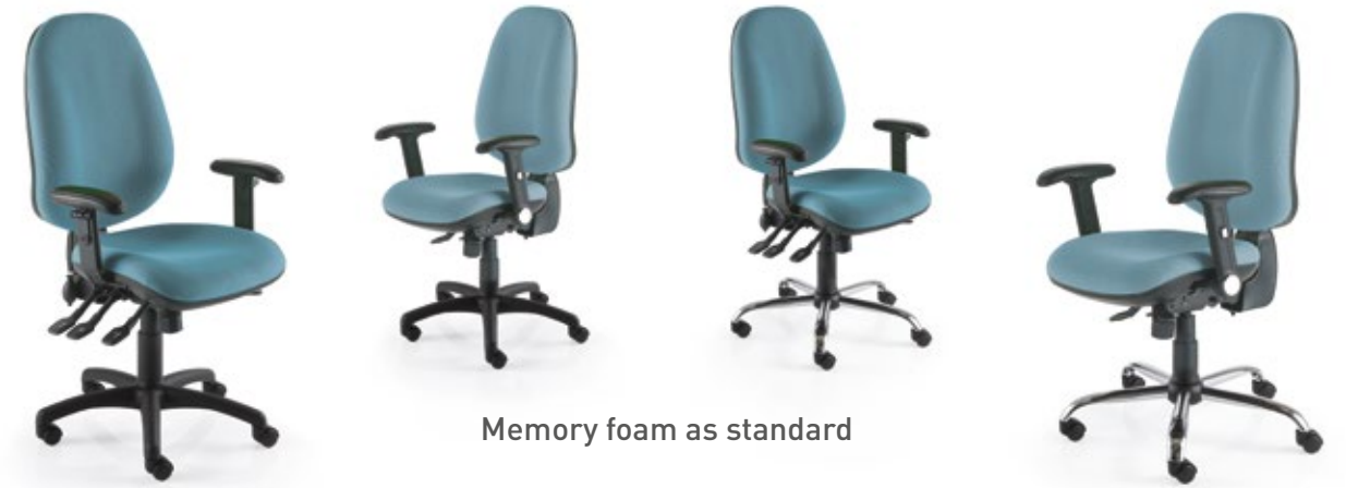
Pi27(3)SS MFS AA

ECO POSTURE (MEMORY FOAM) A robust task chair with the added benefit of memory seat foam as standard.