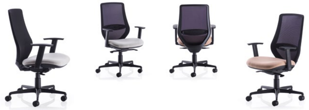
POSE (10SS) AAS

POSE Distinctive back design with adjustable lumbar support, seat slide and self-tensioning mechanism.