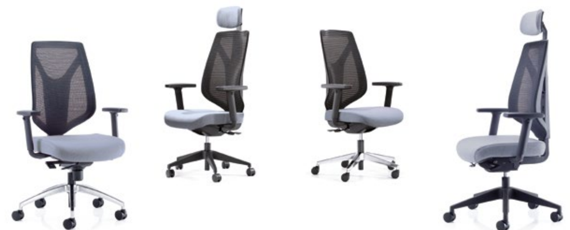
MTM2A (10SS) CSB

MENTOR MESH Sculptured mesh back chair with ratchet back height adjustment, seat slide and self-tensioning mechanism.