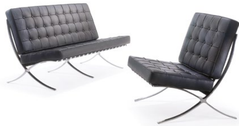
CLASSIC Timeless design, curved chrome legs and simple square buttoned cushions provide stunning looks.

Classically inspired and featuring timeless designs, this range of single chairs and sofas combine to add a touch of sophistication and opulence to any modern office environment.