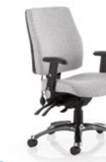
PM2 AAG CBY