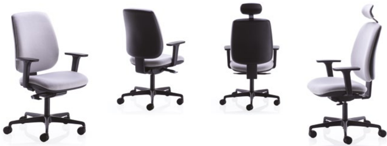
TEMPO (10SS) AAS

TEMPO Substantial task chair with synchronised body balance mechanism, seat-slide & ratchet back height adjustment.