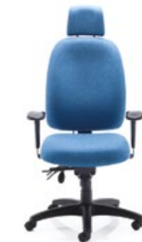
PPI(3) SS-HR AA