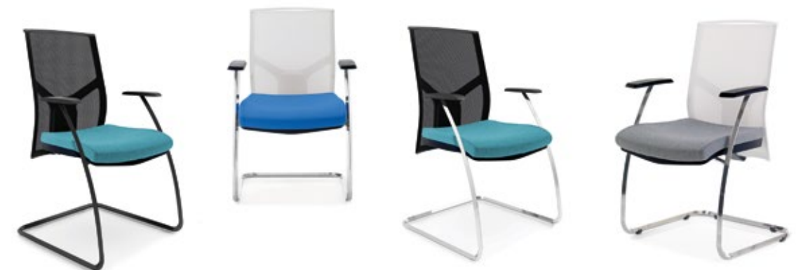
AeM BLACK BCA

AEON MESH Contemporary boardroom and meeting chairs in black or chrome frames.