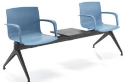
BEAM JL(2)PL + BST

ECLAT BEAM Multi-position beam units with fully upholstered seats.