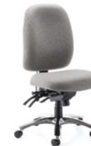
PPI(3) SS CBY