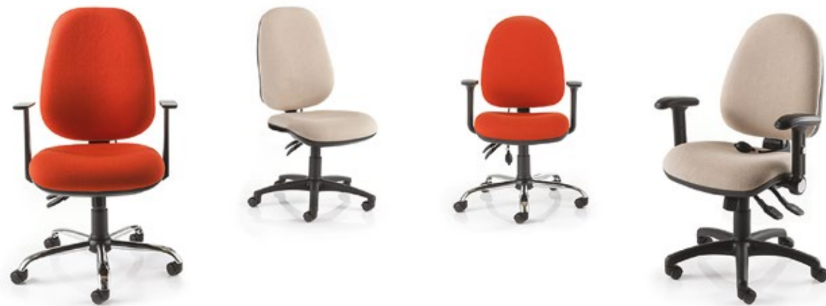
Pi23(3) AAT SCB

PRETORIAN Popular task chair with inflatable lumbar in standard size or with optional larger seat and backrest.