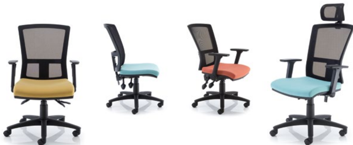
LINX(2) SS AAT

LINX A generously proportioned mesh chair with a choice of two mechanisms and optional headrest.