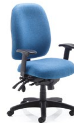
PPI(3) SS AA

POSTURE PLUS Memory foam seat, inflatable lumbar, seat slide and tilt with height adjustable backrest.