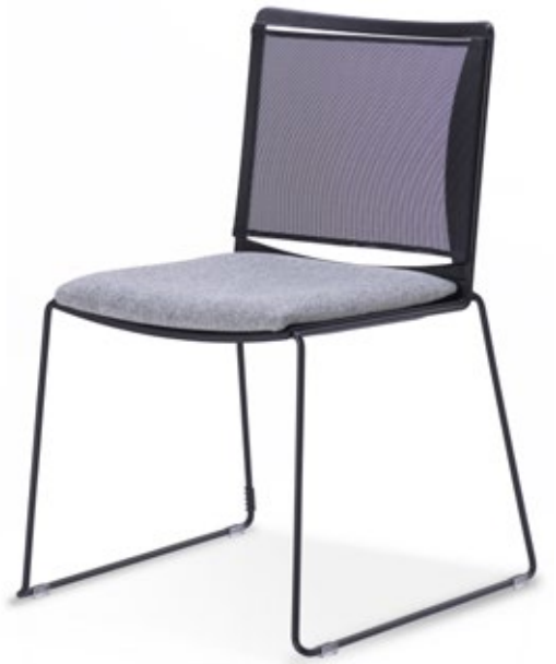
RIVA MESH (SP)