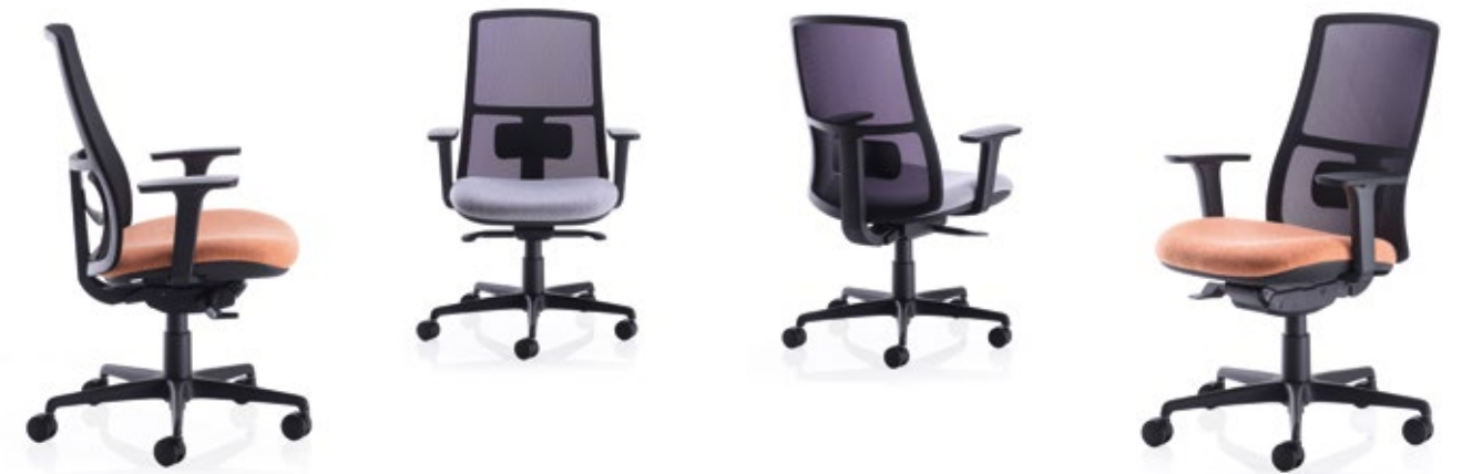
MOTION (10SS) AAS

MOTION Broad mesh back design with adjustable lumbar support, seat slide and self-tensioning mechanism.