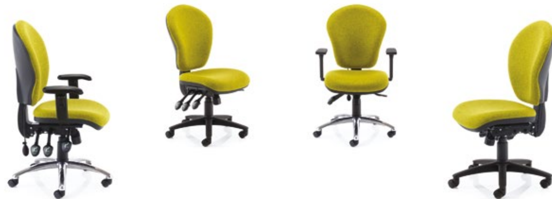
E1(S)AA ILS CBY

E1 Posture chair with standard backrest, multi-function mechanism, memory foam seat and integral seat slide.