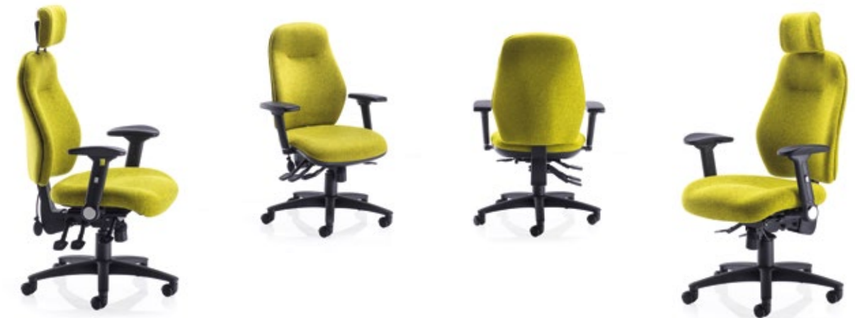
E4 (XL) HR AAGC ILS

E4 Posture chair with extra large sculptured back, multi-function mechanism, memory foam seat and integral seat slide.