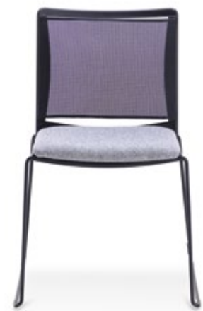
RIVA MESH (SP)