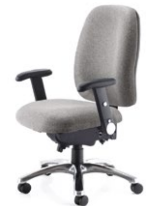
PPI(3) SS AAG CBY