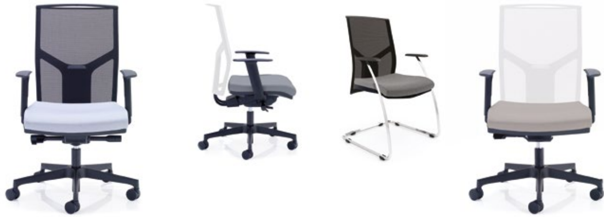
AeM BLACK(10SS) AAT

AEON MESH Awe-inspiring task and side chair offering, available in a contemporary black or white mesh finish.