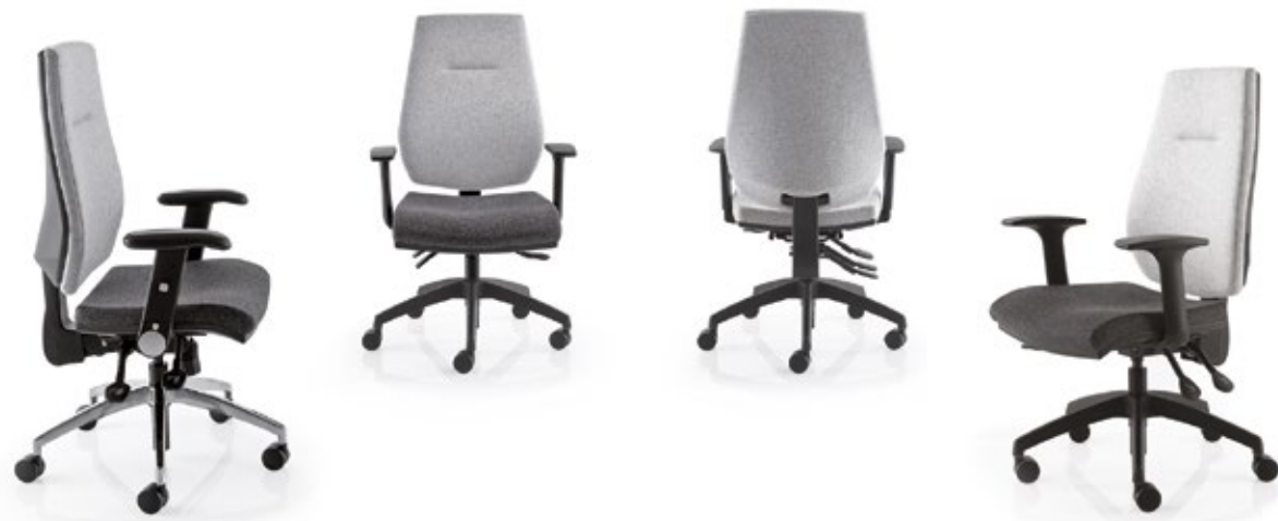
VG(4) AAG CSB

VEGA Modern task chair with tailored upholstery and stitch detail with a choice of mechanisms.